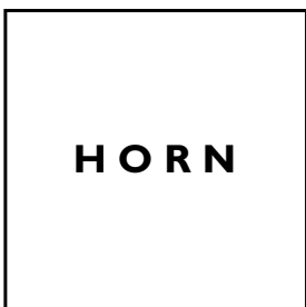
Turn 1: Score 14