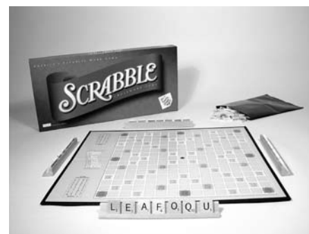
Standard Scrabble Version