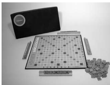
Selchow and Righter version

Today, an estimated 35 million people are SCRABBLE players. SCRABBLE games can be found in almost every household in the country. And, the SCRABBLE game is one of a select number of games to be included in the GAMES Magazine’s game Hall of Fame—an honor given only to games that meet or exceed the highest standards of quality and play value.