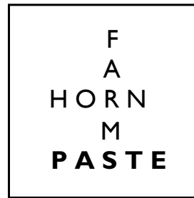
Turn 3: Score 25