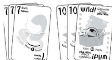
a natural meld of 7's a mixed meld of 10's

First Meld Example You need 50 points to make your first meld requirement on your first hand. You meld these two sets, worth a total of 55 points, to "get into the game."