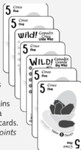
a Mixed Canasta of 5's

Combine into one set all cards of the same rank that either you or your partner melds. One partner keeps all of the partnership's melds.