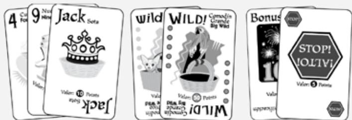
Natural cards Wild cards Bonus & Stop cards

"big." The only difference between the little and big wild cards is their scoring value. A wild card can take the place of a natural card in any set, but a set must always have more natural cards than wild cards. For example, this means you may have only one wild card in a set of three cards. Once melded, a wild card cannot be moved to a different set. Wild cards can never be melded in a set of their own. As noted above, wild cards freeze the Prize pile when they're discarded.